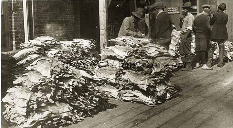
Common sight of dried cod tied up in bundles after drying on fish flakes, likely in Portland.