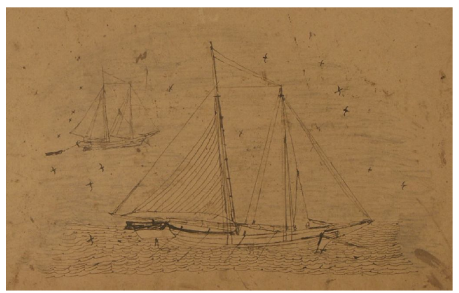
Drawing from the log of the Emeline , William Ward, Master, out of Tremont, 1864. This fine pencil and ink drawing on the back of the logbook shows a typical handlining fishing schooner. Four lines extend out from tiny figures along the rail into the water. Birds circling round may have been eating herring or menhaden, and a schooner in the distance, attracted by the activity, will soon arrive to start fishing.

After the Massachusetts cod fishery exhausted once-abundant shore stocks, it moved down the Maine and Nova Scotia shores and toward offshore grounds as far away as the Grand Banks. In contrast, Maine's cod fishery east of Casco Bay remained relatively unchanged from first settlement until after the Civil War, thanks to light fishing pressure, enormous quantities of inshore forage, and ample spawning grounds.