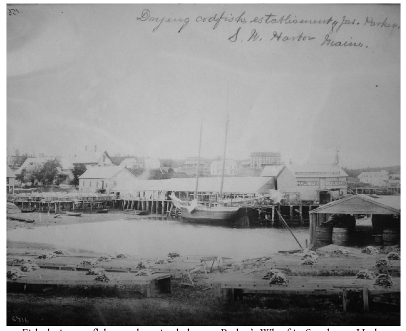
Fish drying on flakes under rain shelters at Parker's Wharf in Southwest Harbor.

fyke nets, and 12,900 lobster traps. Landings included 6,534,125 pounds of cod, over one and a half million pounds each of hake and haddock, over 200,000 pounds of pollock, and 100,000 pounds of cusk. Nearly all of this catch was still salted and dried on flakes—the rest pickled or smoked. Since average vessel displacement was just over 32 tons, most of these vessels and all of the boats were still fishing within sight of Mount Desert Island in what was then called the "shore fishery." In addition, fishing communities in the Mount Desert Island region produced over 600,000 pounds of pickled mackerel, 500,000 pounds of pickled herring, and 579,000 pounds of smoked herring. They also marketed over 1.6 million pounds of lobster and 151,000 pounds of clams.