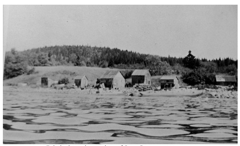
Fish shacks on the east shore of Otter Cove, ca. 1900.

Damon recalls hand lining east of Baker Island and selling the catch at Beals, after the Stanley Fish(be consistent should Fish be in the name above?) Wharf burned down in the 1960s. In that same area, Damon explains, it was not uncommon to catch 500 to 700 pounds in a three-to four-hour period. They would dress (gut) the catch and bring it to Beals for four and a half cents per pound. He recalls one day catching two cod in the 30- to 40-pound range. In the mid 1960s, 15 to 25-pound cod where more the norm but "when you went out handlining, there was no doubt that you caught something."